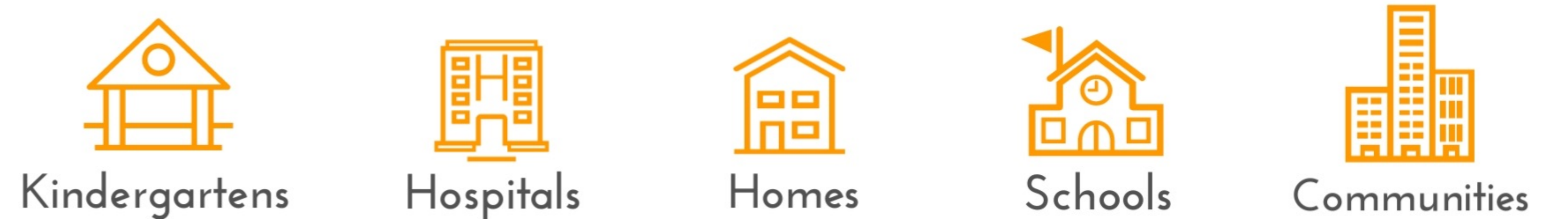
Early Childhood Work Settings