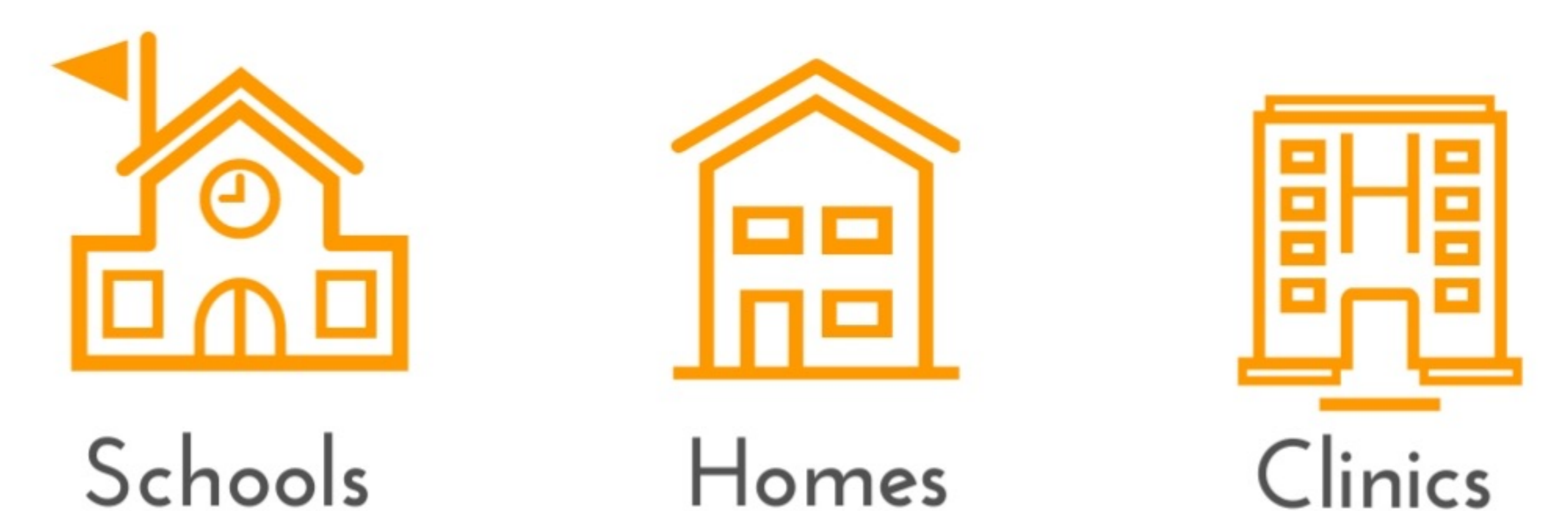
Early Childhood Work Settings