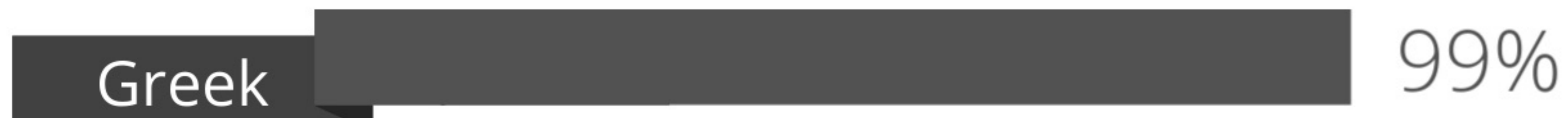
Commonly Spoken Languages