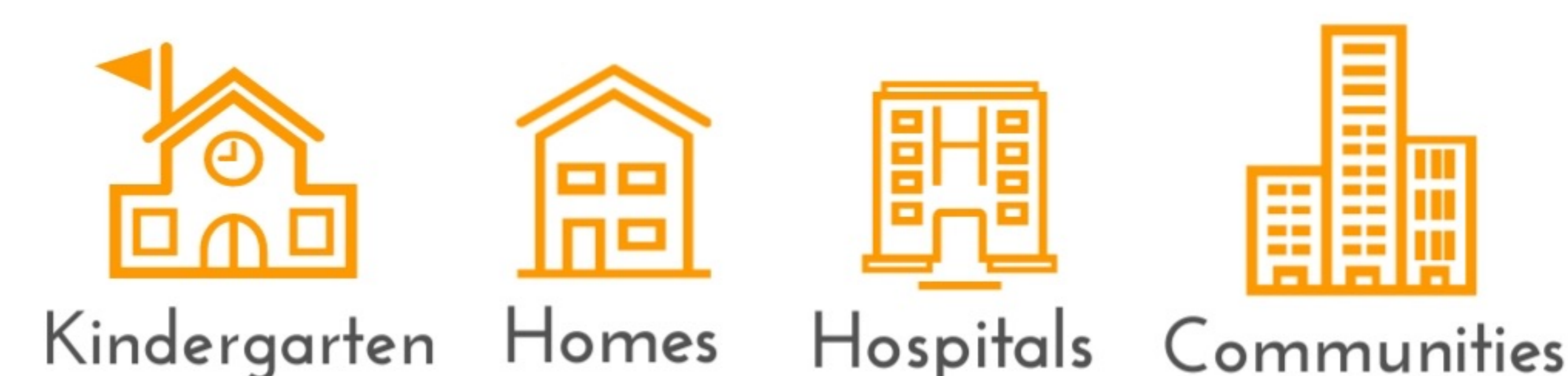
Early Childhood Work Settings