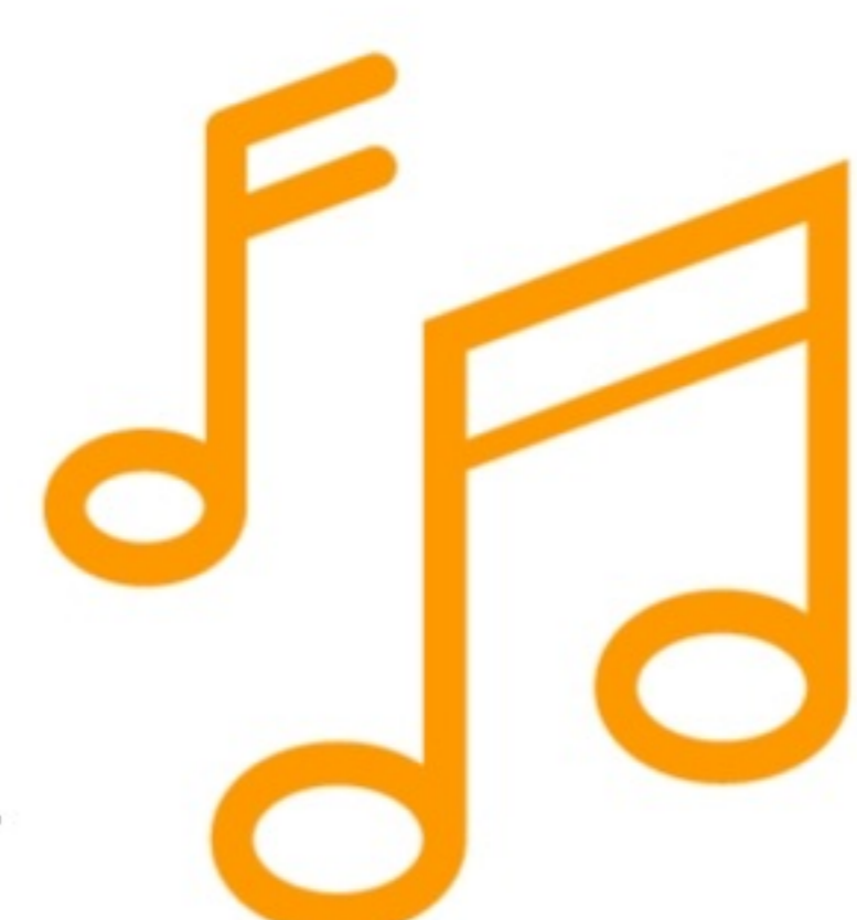
Work With Young Children